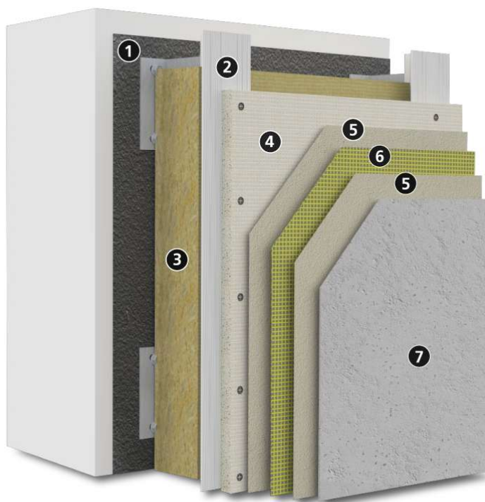
Figure 1 – StoVentec Render System